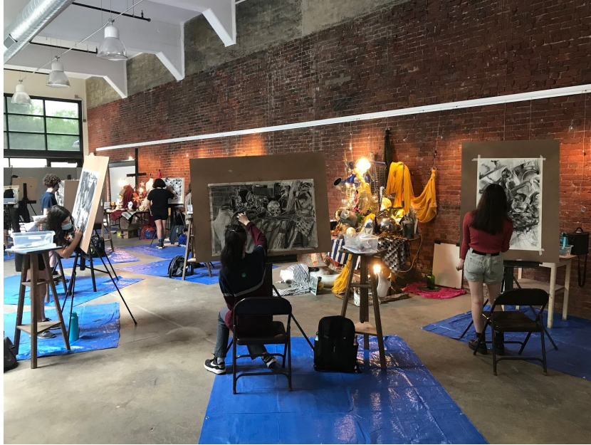
Art Institute Students working at The Trolley Barn