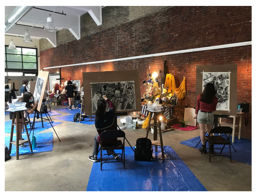
Art Institute Students working at The Trolley Barn